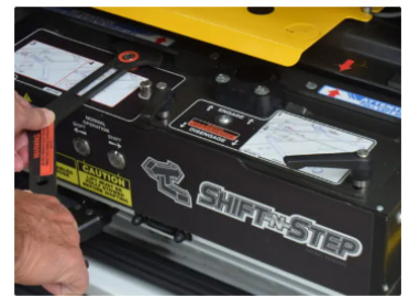
Manual Back Up System