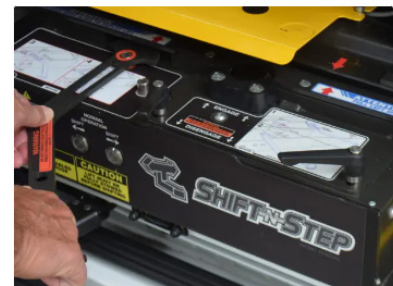
Manual Back Up System