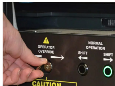
Electrical Key Override