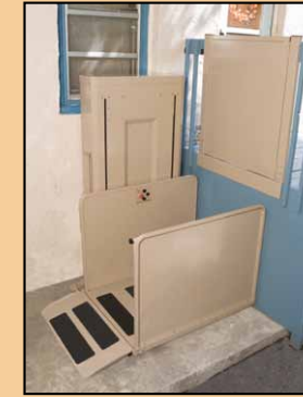
VERTICAL PLATFORM LIFT