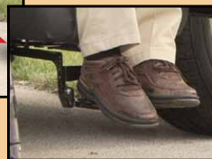
Shown with optional footrest

Bruno also offers the Turny , a rotating/lowering seat to assist individuals who have difficulty transferring in and out of higher vehicles. (shown above)