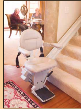
ELECTRA-RIDE™ ELITE STAIRLIFT