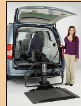
JOEY™ VEHICLE LIFT