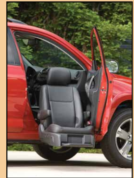
COMPACT LIFT-UP® SEAT