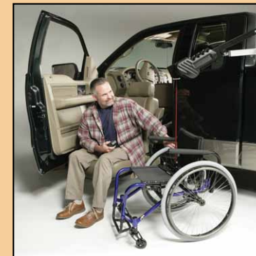
Shown with Out-Rider Lift